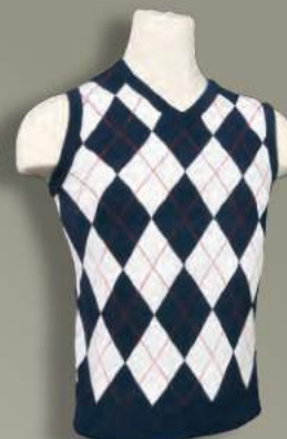
SW WNR White/Navy/Red Overstitch