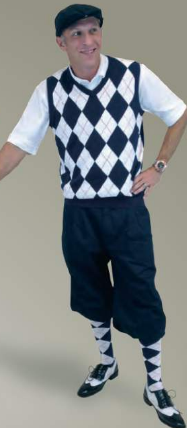
Navy/White/ Red Overstitch MCO040WNR1 $156.50