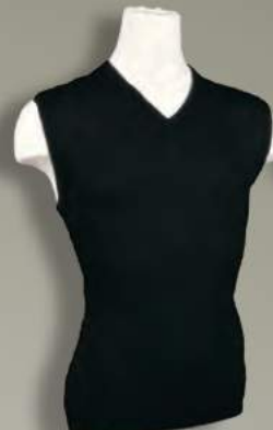
SW B Solid Black