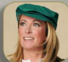
CAP 100 green