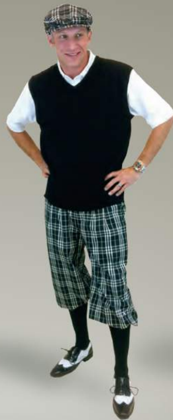
Black Check Royal Troon Knickers MCO301B1 $225.50