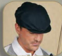
CAP 060 black