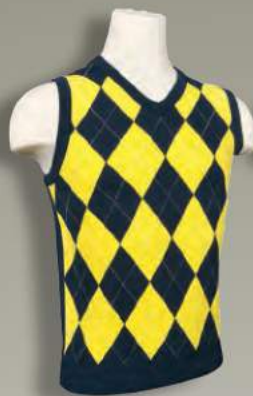
SW NYW Navy/ Yellow/ White Overstitch

Light Blue/White/Black Overstitch SWLBWB