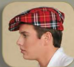
CAP 201 red/navy blue plaid

Pricing is able to change without notice