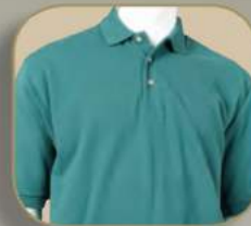
PCM 100 forest