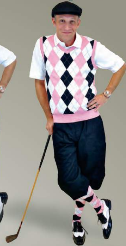
White /Black/Pink/ Light Blue Overstitch MCO060WBPLB1 $156.50