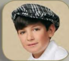
CAP 301 royal troon check black