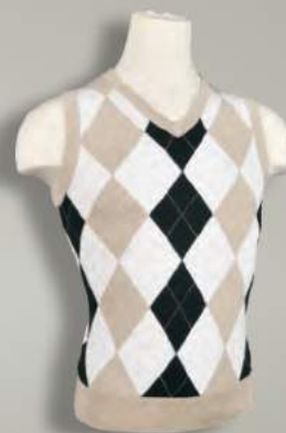
SW KWBW Khaki/White/Black/ White Overstitch