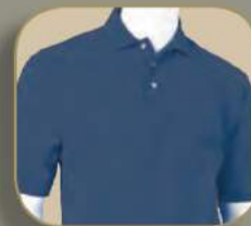
PCM 040 navy