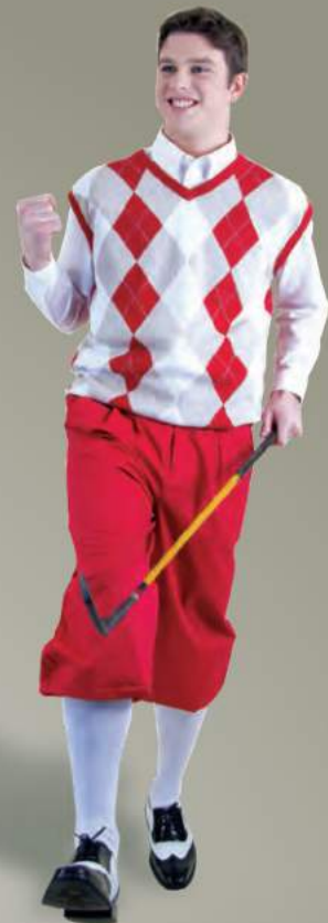
Red/Khaki/White/ White Overstitch MCO090RKWW1 $156.50