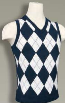
SW NWN Navy/White/ Navy Overstitch