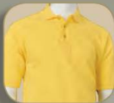
PCM 016 athletic gold