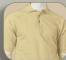
PCM 020 khaki