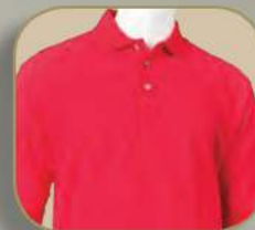
PCM 090 red