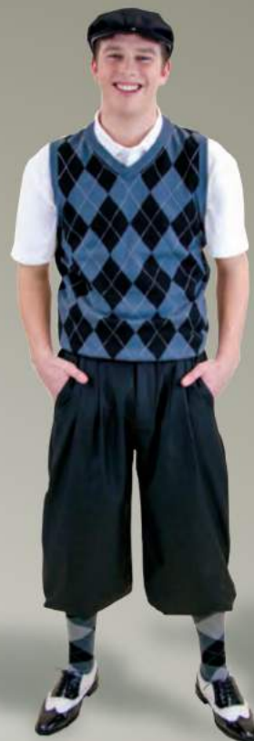
Black/Grey/ Light Grey Overstitch MCO060BGLG1 $156.50