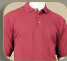
PCM 017 burgundy