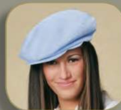
CAP 401 blue pinstripe