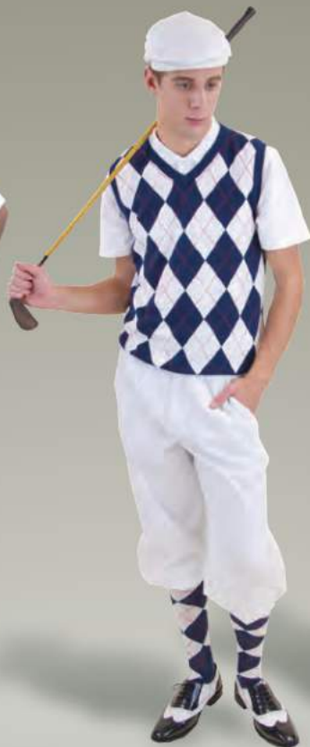
White/Navy/ Red Overstitch MCO010WNR1 $156.50