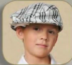
CAP 302 royal troon check white