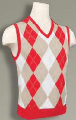
SW RKWW Red/Khaki/White White Overstitch