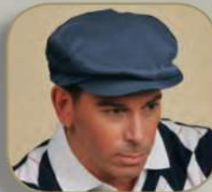
CAP 040 navy