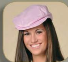
CAP 402 pink pinstripe