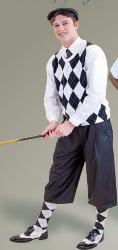
White/Black/ Grey Overstitch MCO060WBG1 $156.50