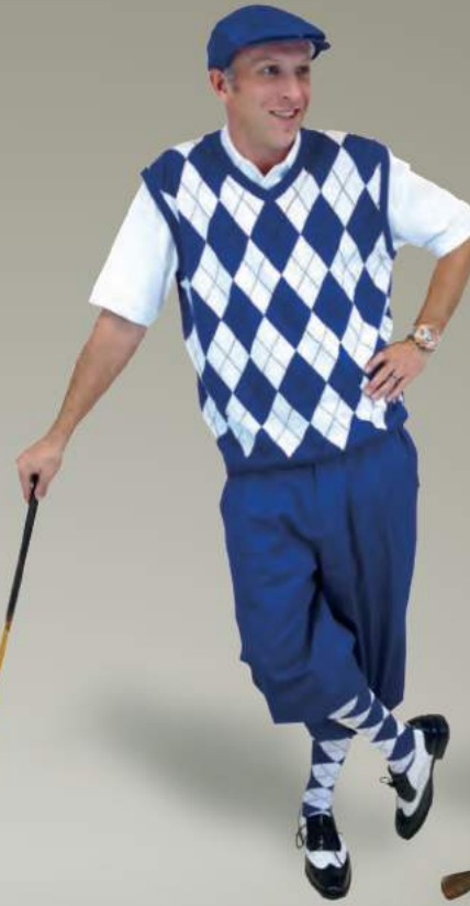
Royal/White/ Black Overstitch MCO050RWB1 $156.50