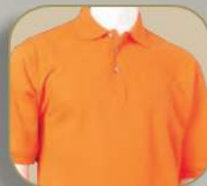
PCM 015 orange