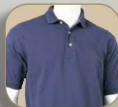
PCM 050 royal