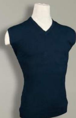
SW N Solid Navy