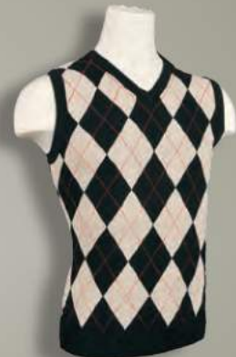
SW BKR Black/Khaki/ Red Overstitch