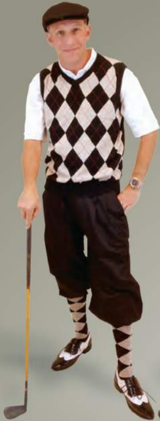
Black/Khaki/ Red Overstitch MCO060BKR1 $156.50