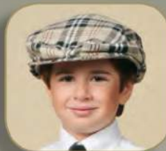
CAP 202 black/khaki plaid