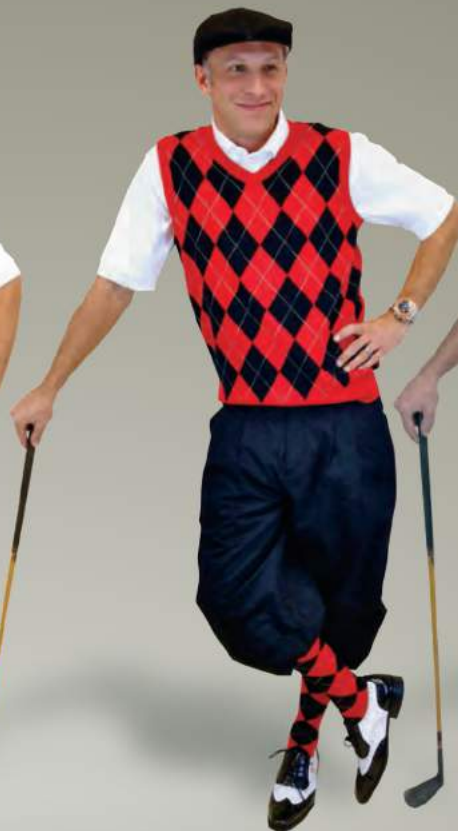
Black/Red/ White Overstitch MCO060BRW1 $156.50