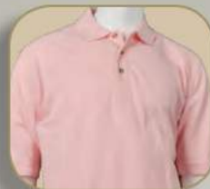
PCM 012 light pink