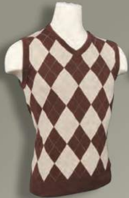
SW KBW Khaki/Brown/ White Overstitch