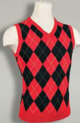
SW BRW Black/Red/ White Overstitch