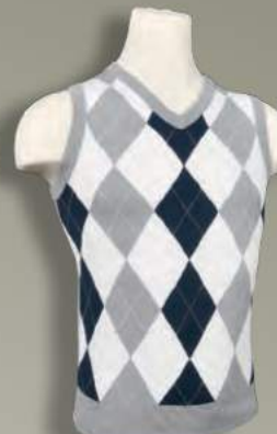
SW NWLGW Navy/White/Light Grey/ White Overstitch