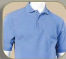
PCM 014 faded blue