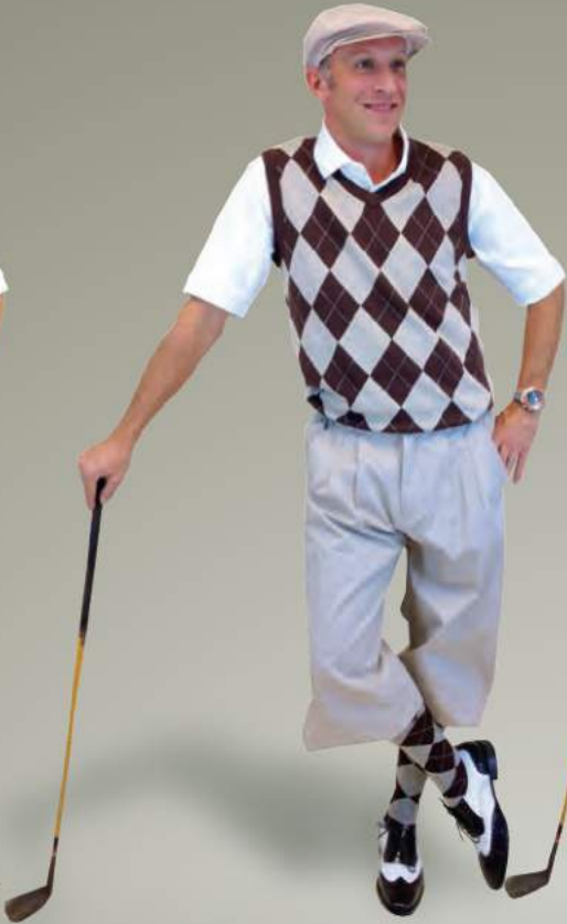
Black/Khaki/ White Overstitch MCO020BKW1 $156.50