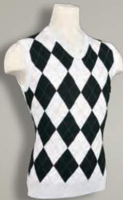
SW WBG White/Black/ Grey Overstitch