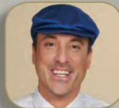
CAP 050 royal