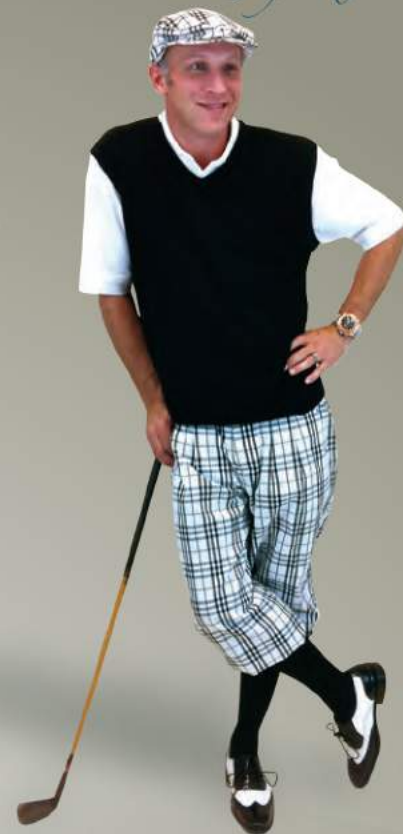
White Check Royal Troon Knickers MCO302B1 $225.50