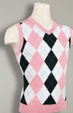
SW WBPLB White/Black/Pink/ Light Blue Overstitch