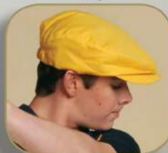
CAP 080 yellow