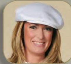
CAP 010 white