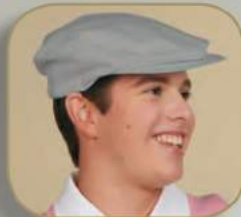
CAP 030 grey