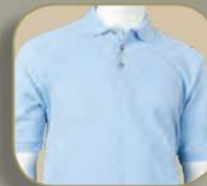
PCM 070 light blue