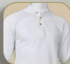
PCM 010 white