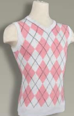
SW WPB White/Pink/ Black Overstitch