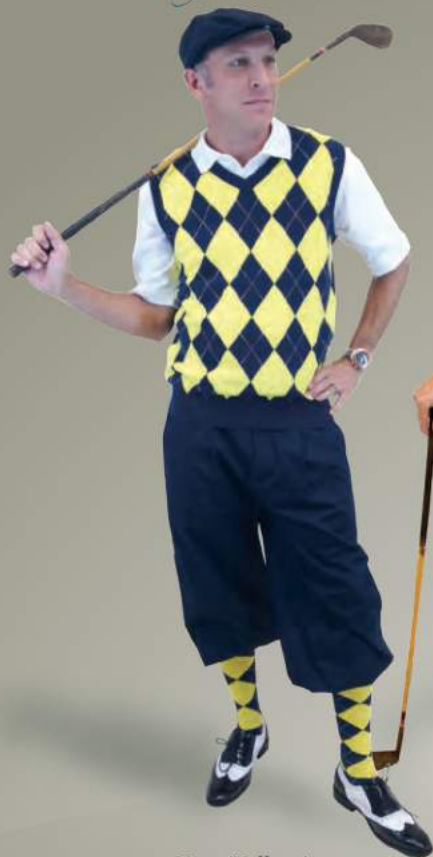
Navy/Yellow/ White Overstitch MCO040NYW1 $156.50