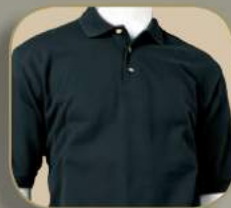
PCM 060 black