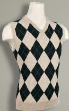
SW BKW Black/Khaki/ White Overstitch