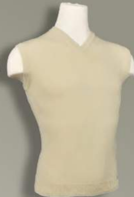
SW K Solid Khaki