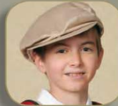
CAP 020 khaki