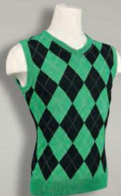
SW BGW Black/Green/ White Overstitch