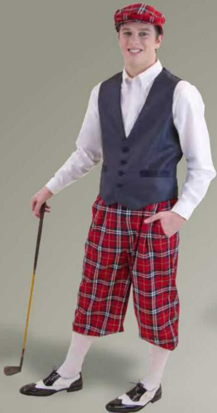
Red Turnberry Plaid MCO201B1 $225.50