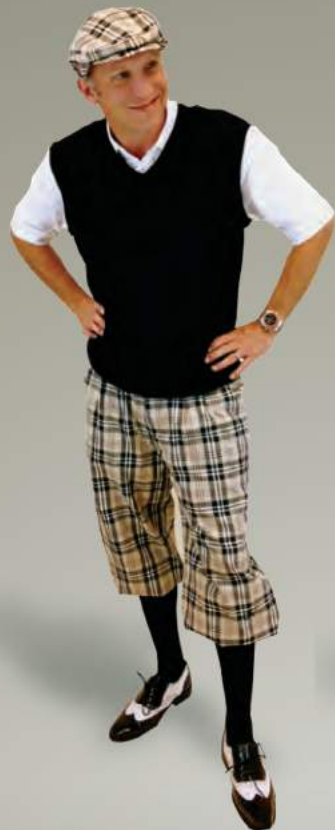
Khaki Turnberry Plaid MCO202B1 $225.50