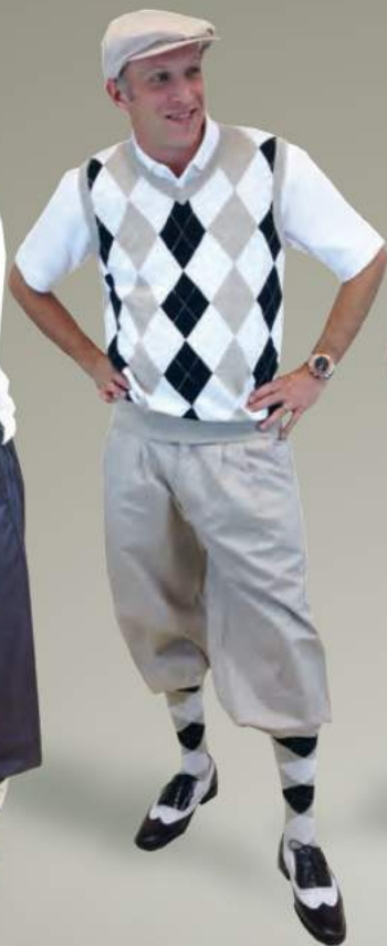
Brown/Khaki/ White Overstitch MCO020KWBW1 $156.50