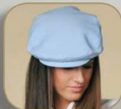
CAP 070 light blue