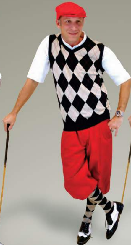
Black/Khaki/ Red Overstitch MCO090BKR1 $156.50