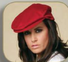
CAP 090 dark red