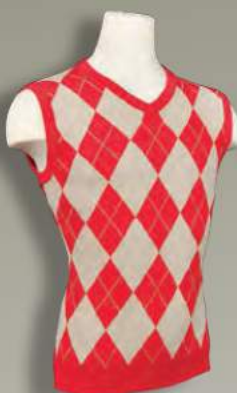
SW RKW Red/Khaki/ White Overstitch