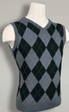
SW BGLG Black/Grey/ Light Grey Overstitch